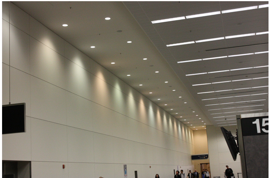
Figure 2: The Problem

In summary, when considering an LED luminaire, you need to make sure the modules inside are of high quality to get better initial color consistency.